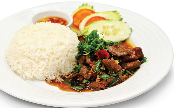
PAD KRA PAO