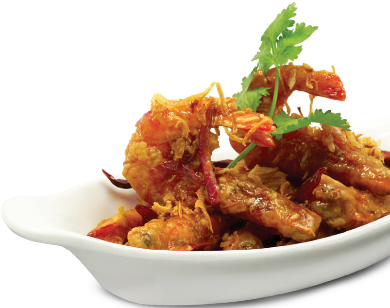
GOONG SOT MAKHAM

KANG KIEW WAAN GOONG 🌶️ THB 260 (GREEN CURRY WITH PRAWNS) Thai Coconut Milk with Green Curry, Prawns, Eggplant, Kaffir Lime Leaves, Basil