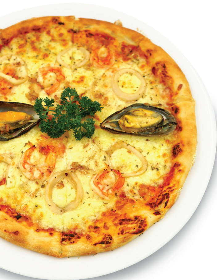
AI FRUTTI DI MARE PIZZA