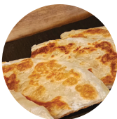
Roti THB 80