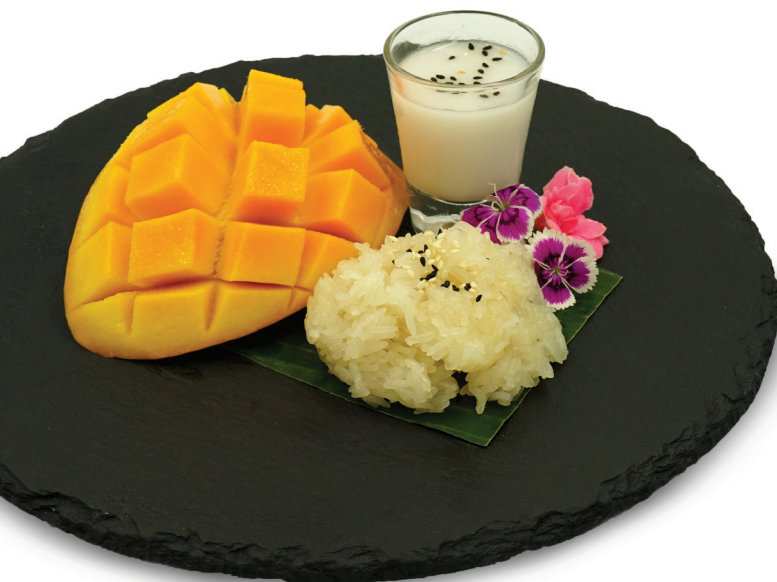
MANGO &amp; STICKY RICE