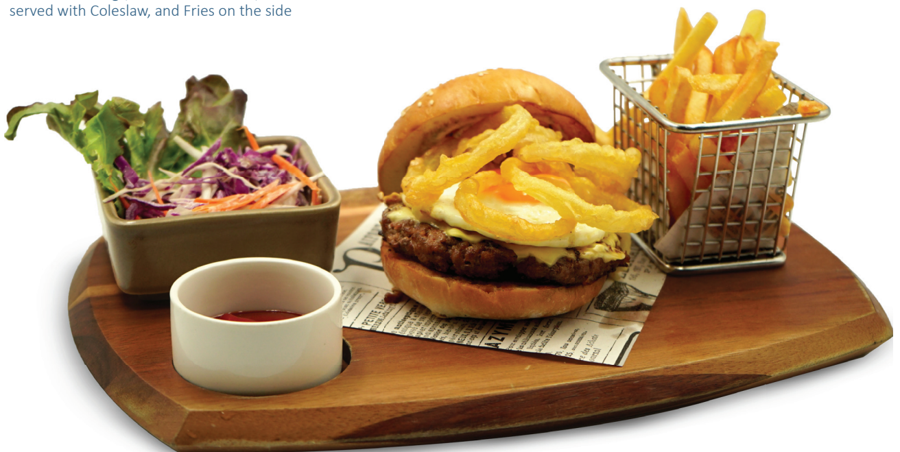
AQUELLA SMASH BURGER

Marinated Cajun Chicken, Bacon, Ham, Fried Egg, Lettuce, Tomatoes, and Cheddar Cheese, served with Coleslaw, and Fries on the side