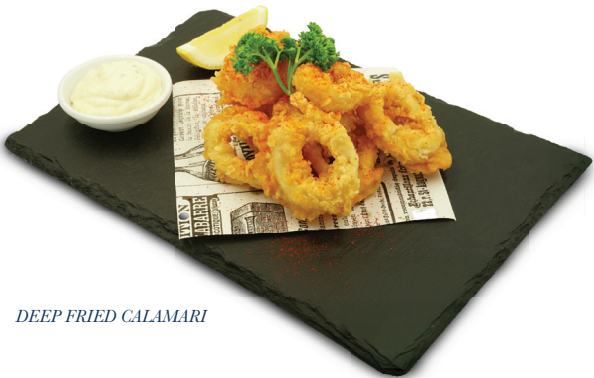
DEEP FRIED CALAMARI