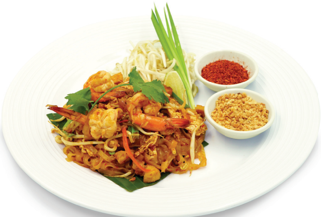
PAD THAI GOONG