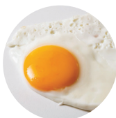
Egg Sunny Side Up THB 25