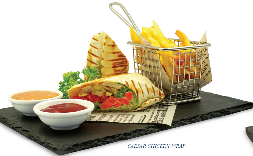
CAESAR CHICKEN WRAP