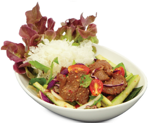
YUM NUE YANG