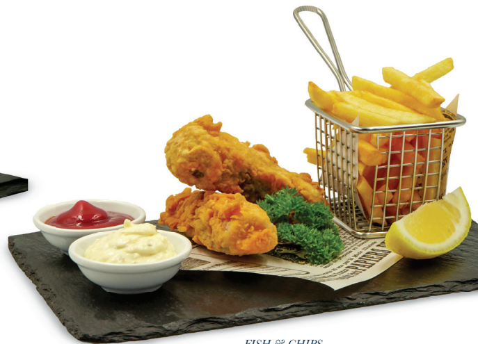
FISH &amp; CHIPS