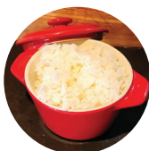
Steamed Rice THB 25