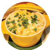
Fried Rice with Egg THB 50