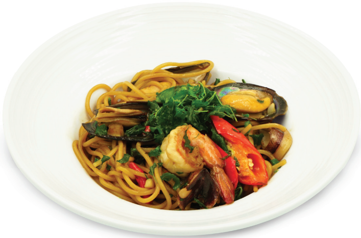
PAD KHEI MAO TALAY

TOM YUM GOONG 🌶️ THB 290 (THAI SPICY SOUP WITH PRAWNS) Spicy Clear Soup with Prawns, Lime, Lemongrass, Galangal, Shallots, Mushrooms, Kaffir Lime Leaves, and Chili Paste