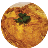
Thai Omelet THB 80